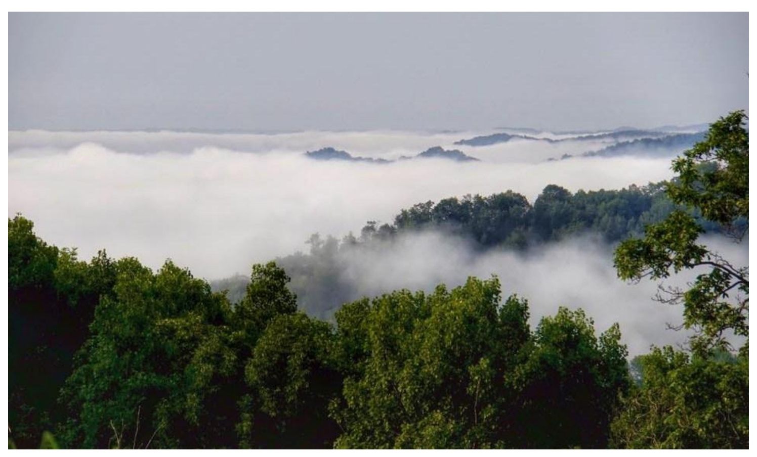
Ocooch Sunrise - Photos by Ricki Bishop unless noted otherwise.