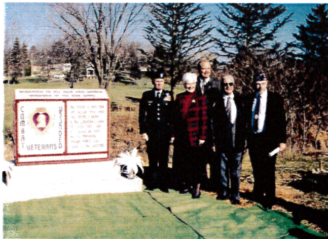
Dedication Richland Center's Purple Heart Monument.

Today, more than 200 entities, including cities, counties, states, sports teams, universities, and countless businesses have proclaimed themselves as "Purple Heart" entities to show their appreciation for the service and sacrifice of America's sons and daughters. Only one, however, can ever claim the title of being the "First" -- That distinction belongs to Richland Center, WI.