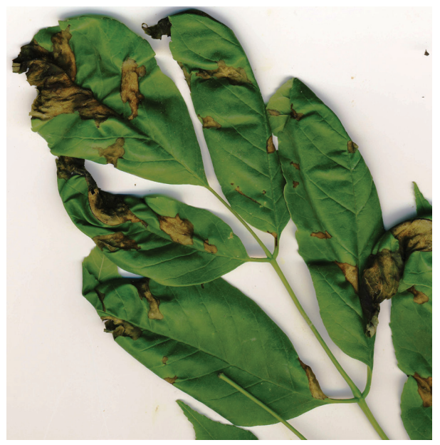
Figure 2. Anthracnose disease of ash causes irregular brown lesions that often follow veins.