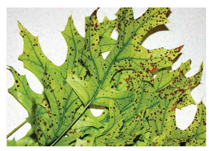
Figure 5. Actinopelte leaf spot (also called Tubakia leaf spot) is common on pin oak trees that are planted in soils with pH greater than 7.0.