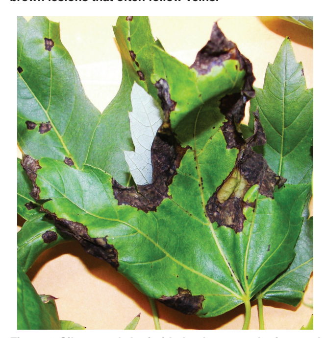
Figure 3. Silver maple leaf with dead areas on leaf caused by anthracnose disease.