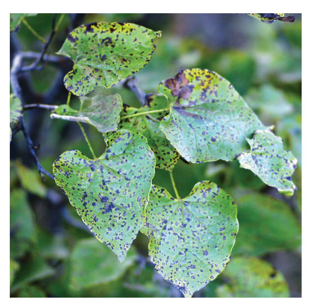
Figure 6. Leaf spot of redbud may result in numerous, small lesions.