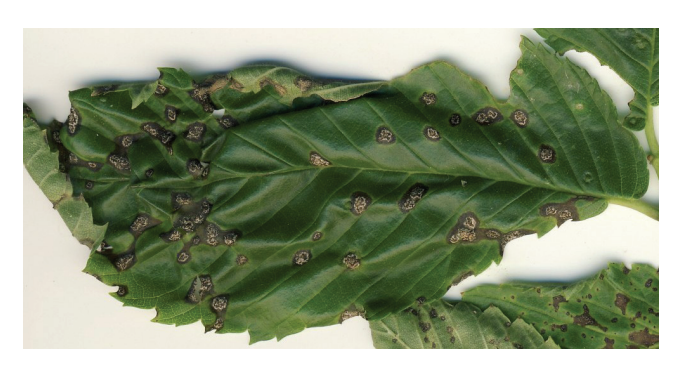
Figure 4. Black spot disease of elm.