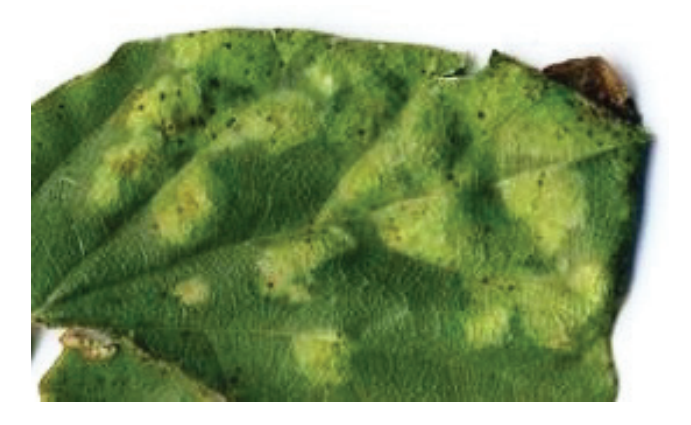
Figure 7. Leaf-blister disease on oak causes irregular raised areas on the leaves.