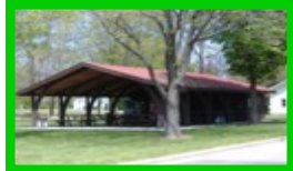
2) Eunice Keepers 200 W. 8th St.