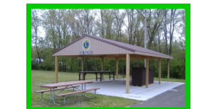
11) Carl Chellevold 23595 WI Trunk 80 N.