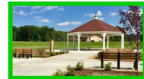
9) JWOM Veteran's Memorial Pavillion 1100 N. Jefferson St.