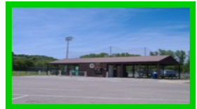
8) Lions w/Concession 1340 Allison Park Dr.