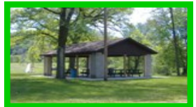
6) B.I. Pippin 1100 N. Jefferson St.