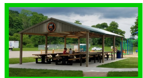
12) RC '68 Hornet Hive 600 W.Seminary St.