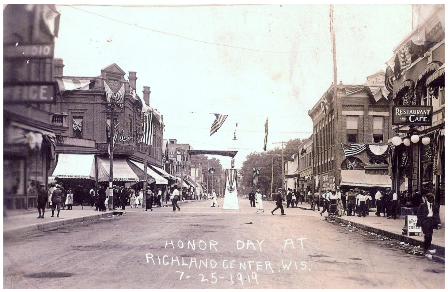
Looking north on Main Street - Richland County History Room photo.

The Honor Day held in Richland Center on July 7, 1919, was a celebration of the return of the local Doughboys who had served in the Great War. The whole town was decorated with flags and banners; a large parade was held along with numerous speeches witnessed by huge crowds of Richland County citizens.