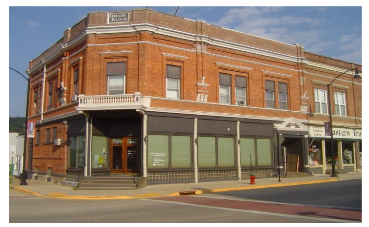
Union Block - Richland County History Room photo.