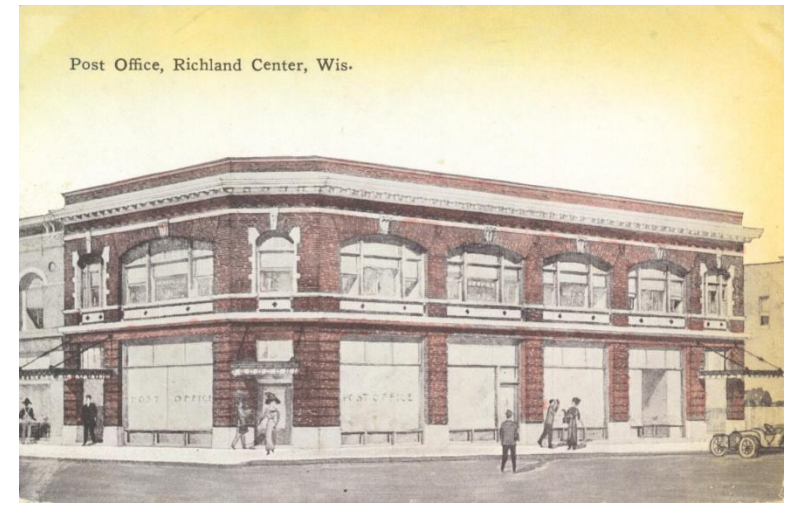
Richland County Bank building

Built in a simplified Georgian Revival interpretation typical of the late historic era, this symmetrically designed post office exhibits plain brick surfaces ornamented by brick quoins, brick lintels with articulated keystones, dentil trim along the eaves and a front piece in a Classical design. White stone accents contrast with the red brick surfaces. Georgian Revival architecture relies on a simple 1 – 2 story box, using strict symmetry arrangements. The front door is centered, often topped with an elaborate crown supported by pilasters. This is the first post office building ever constructed in the city.