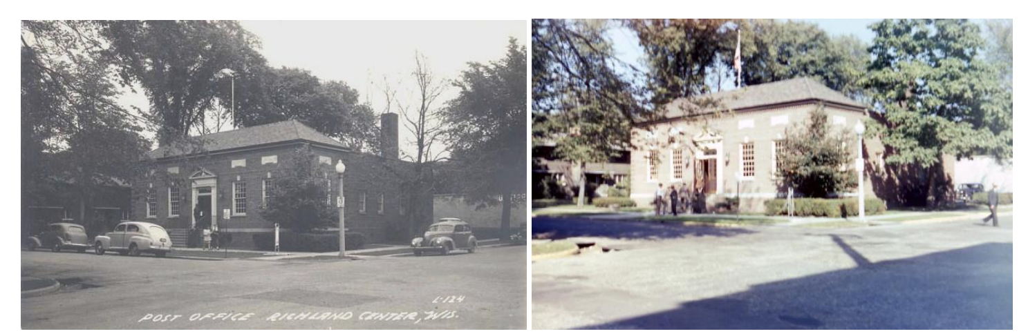
United States Post Office - Richland County History Room photos.