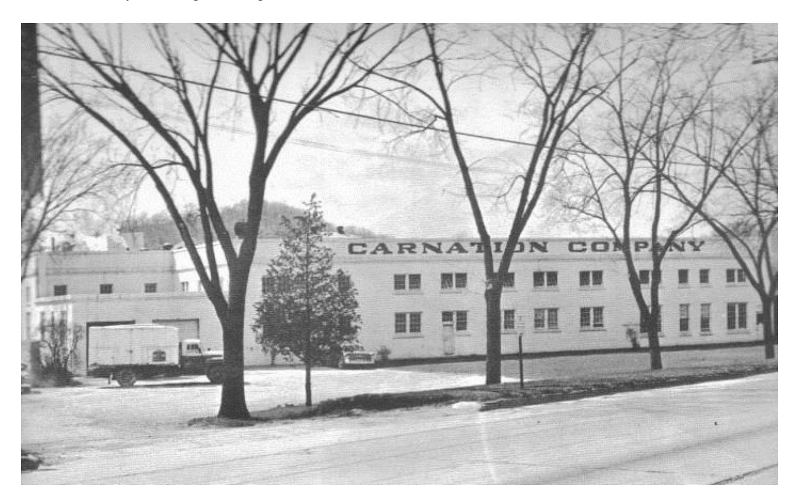
Fluid milk has been processed at this location on Sextonville Road since 1911. Richland Center has four large dairy plants in operation: two by Schreiber Foods, a Foremost Farms-USA plant and Alcam Creamery, a large butter producer. They all have interesting stories to tell also.