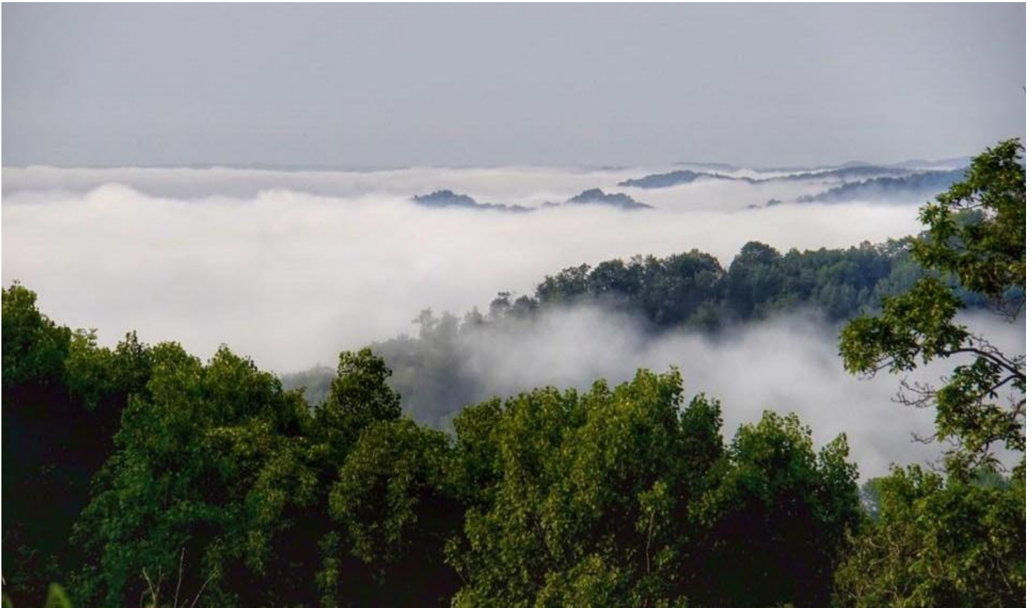
Ocooch Sunrise