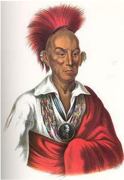
Black Hawk, from "History of the Indian Tribes of North America."