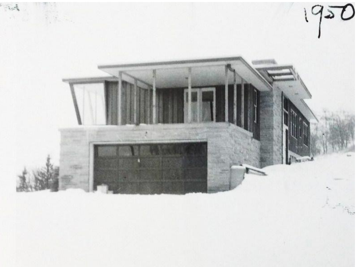
Meyer family photos.