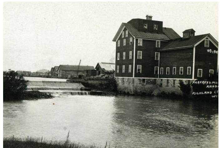
The Mapleside Footbridge and Parfrey's Mill.