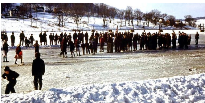
Skating on the Mill Pond.

council on a 3 to 2 vote appealed the order to the state supreme court. The court ruled that the city must replace the bridge because it was a public way that required the same attention as any of the streets in the city. The bridge was replaced at a cost of $19,200 and was reopened in 1954.