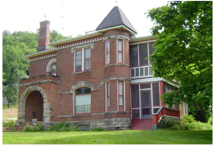
Freeborn-Kirkpatrick House – 109 South Sheldon Street – 1892.