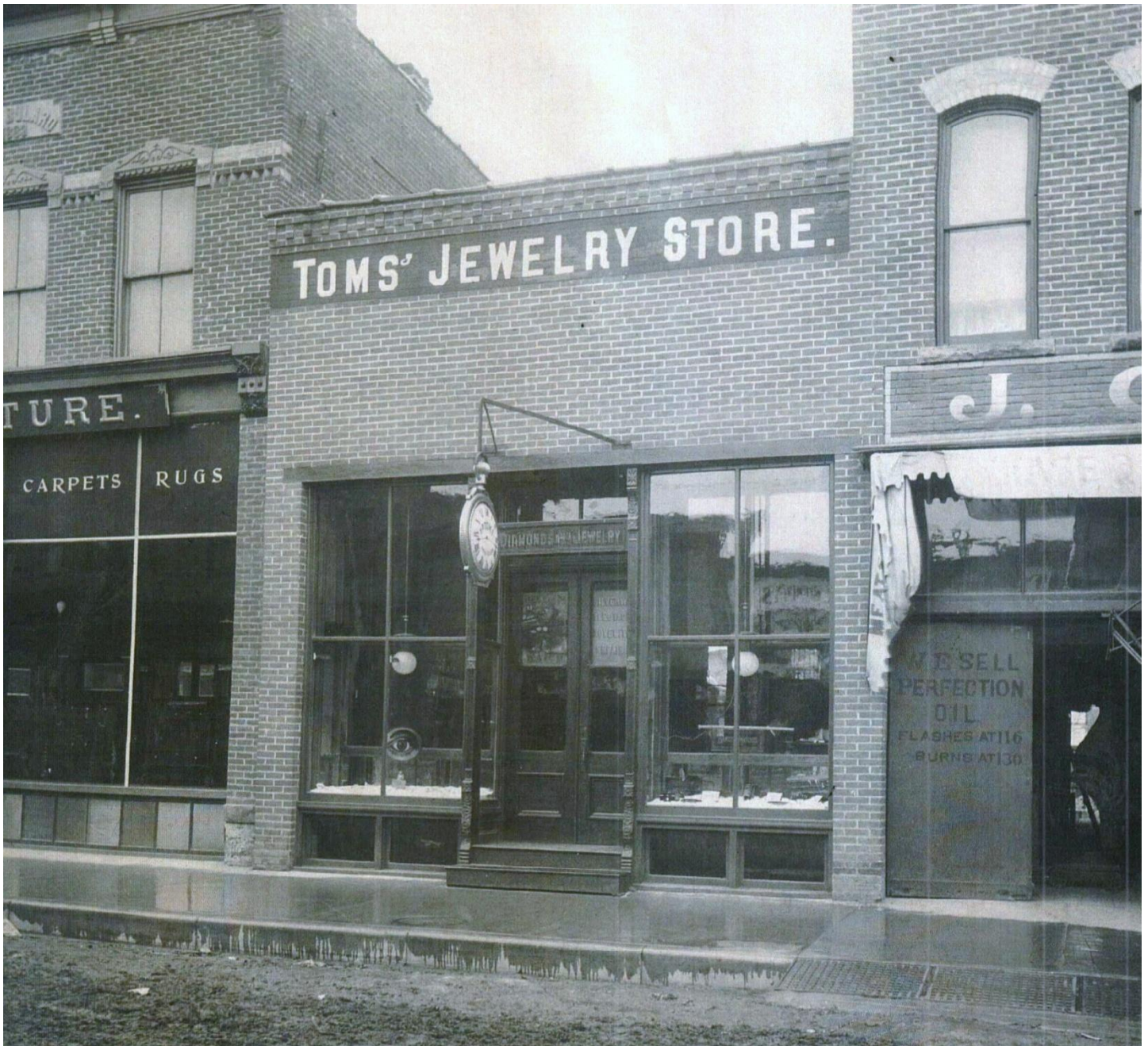
H. Toms' Jewelry Store