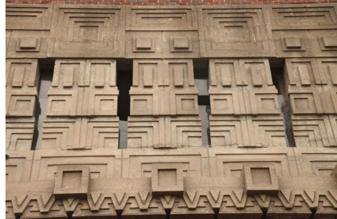
A.D. German Warehouse