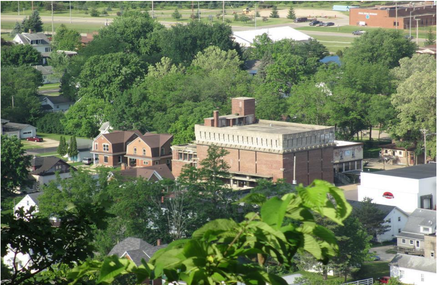
All four German properties today