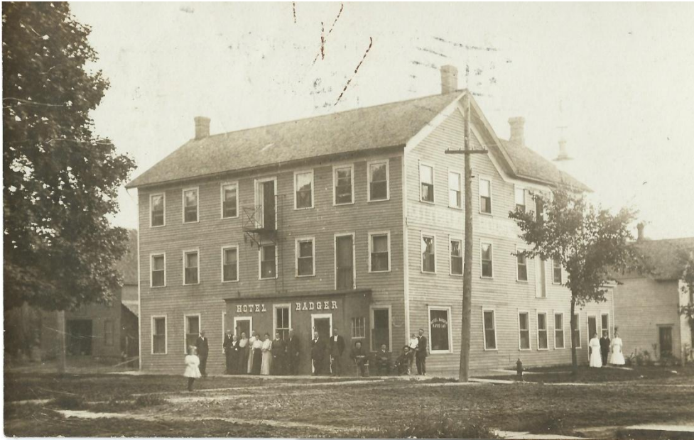
The Hotel Badger in 1909.