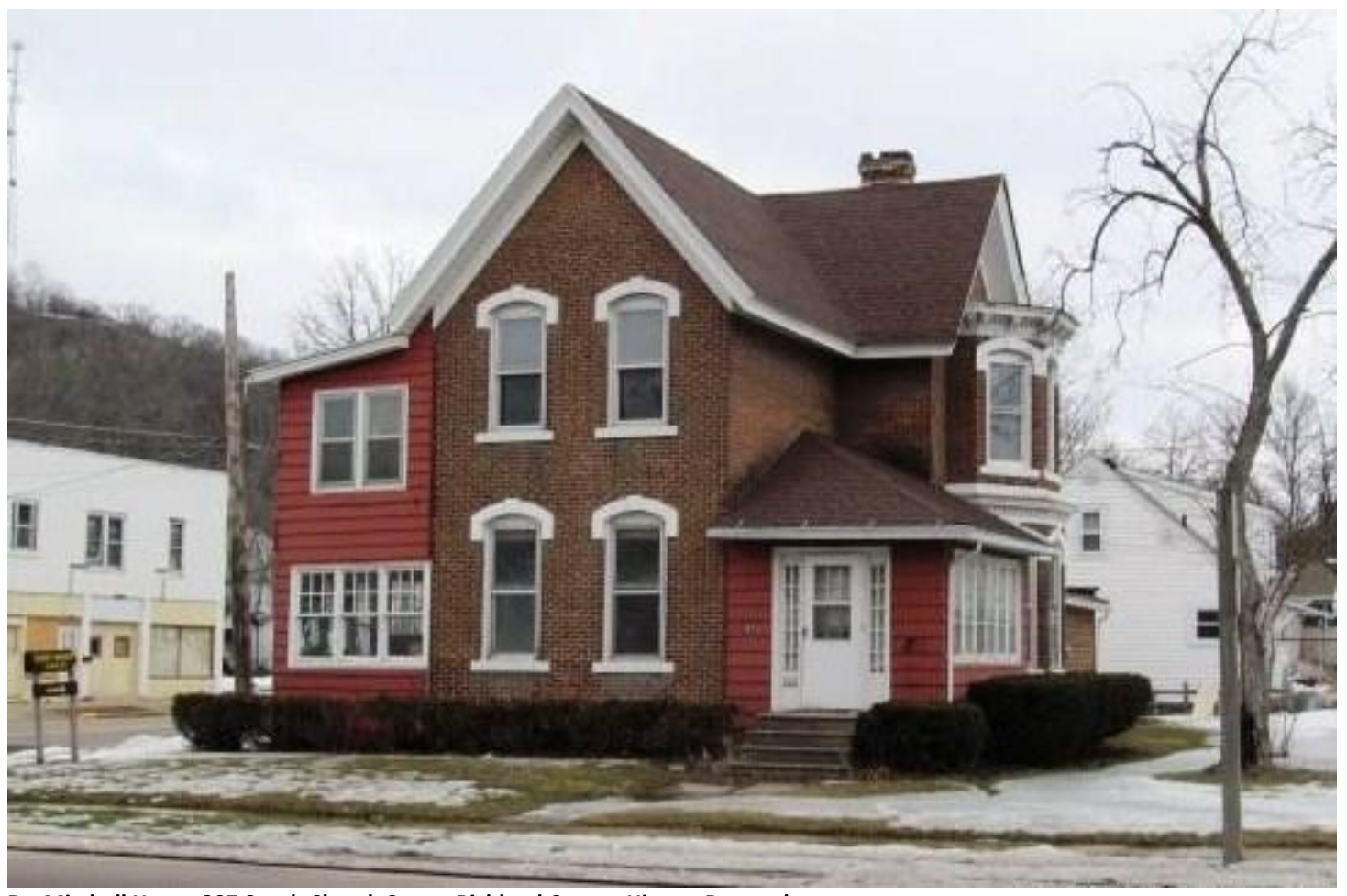
Dr. Mitchell House 307 South Church Street