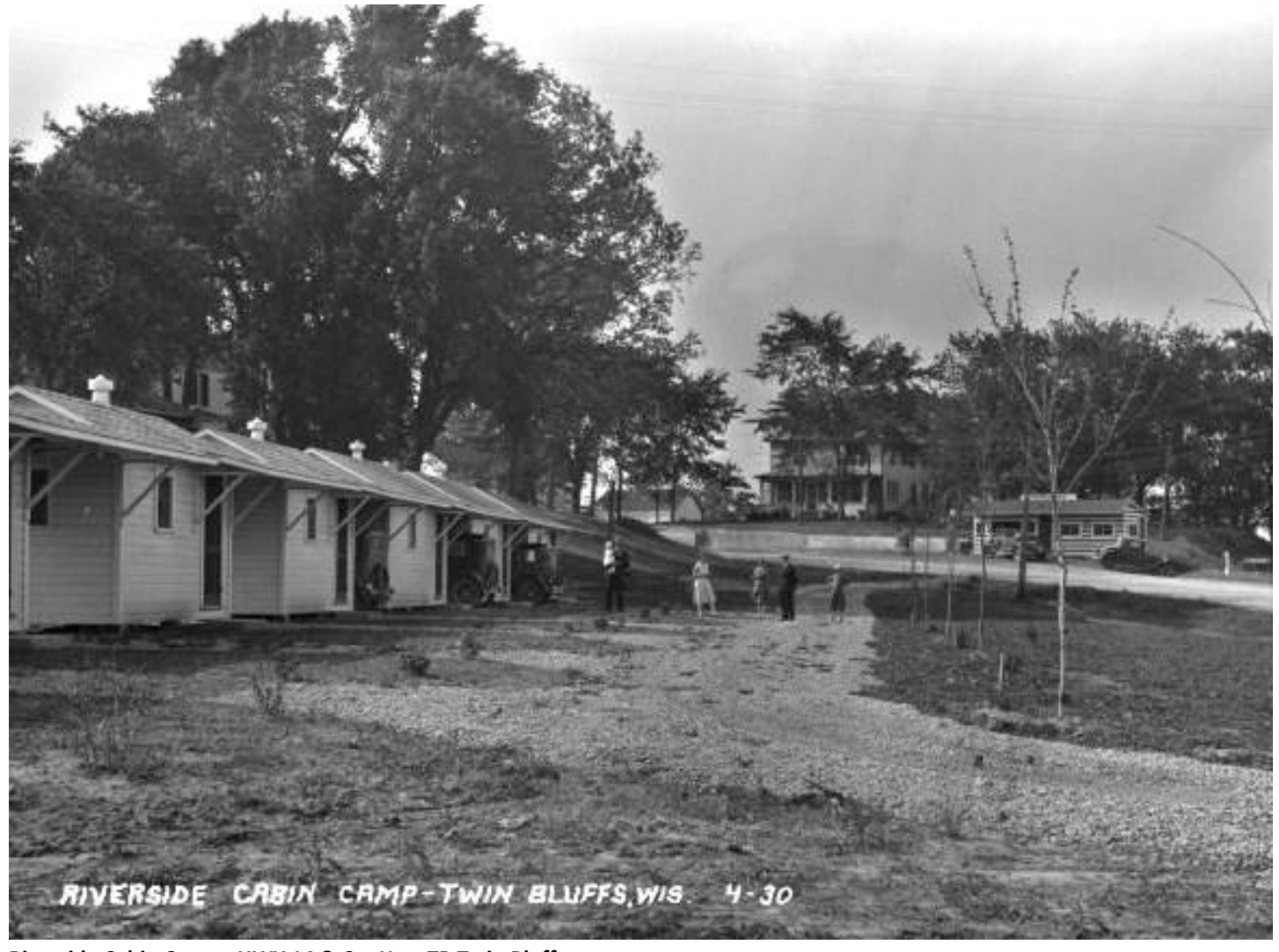
Riverside Cabin Camp - HWY 14 & Cty Hwy TB Twin Bluffs.

Naturally, the greatest numbers of tourist courts and motels were near popular tourist destinations, such as much of the state of Wisconsin, and in larger cities.