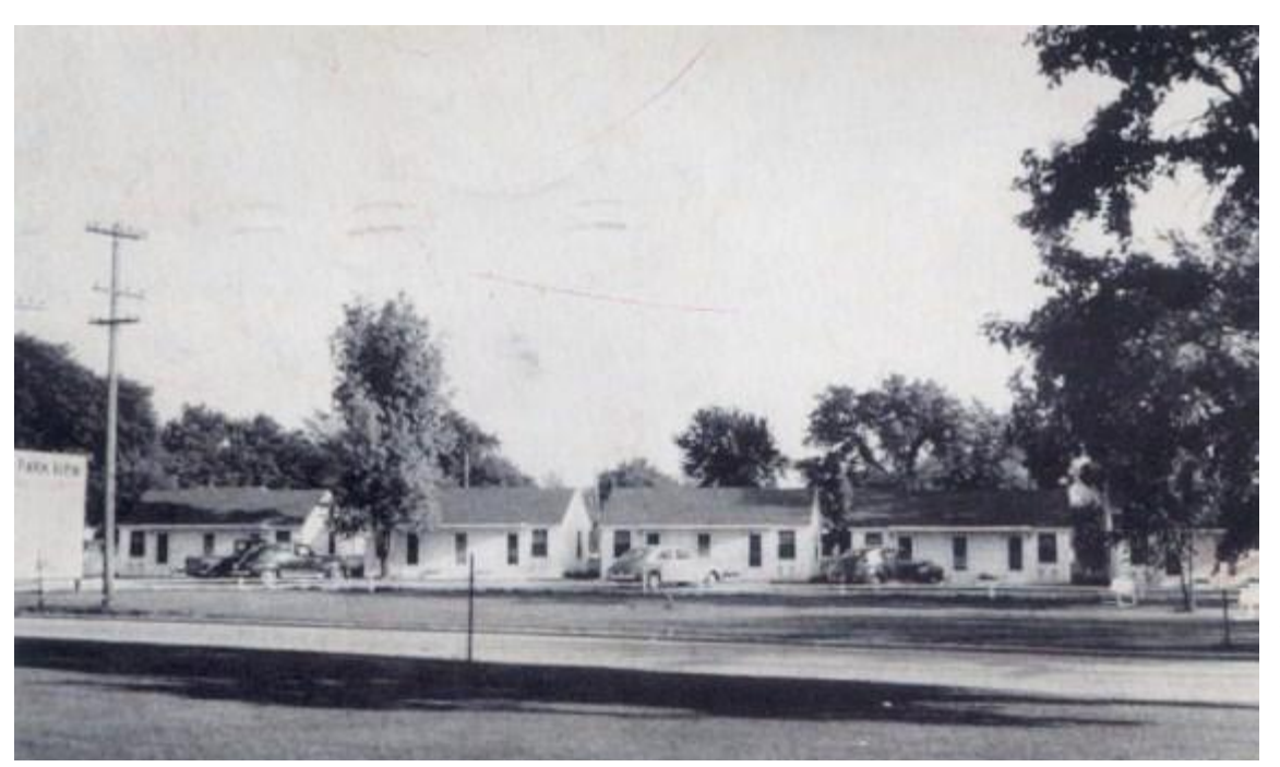
Park View Tourist Court - U.S. Hwy 14 West, Richland Center.

campgrounds did not last into the 1930s, due mostly to overcrowding, increasing costs, and the potential profits to be made from the growing numbers of Americans on the road. The building in Richland Center's Krouskop Park known as "the warming house," was actually the kitchen building for such an auto camp.